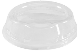
12-24oz (98) Clear Sip Lid LEF098-CS