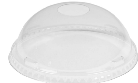
32-44oz (115) Clear Dome Lid LED115-CH

Floor stocking available when annual usage exceeds 100,000 cups per size.