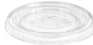
32oz (107) Clear Flat Slotted Lid A636P