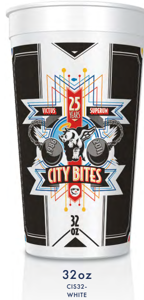
32oz CIS32- WHITE