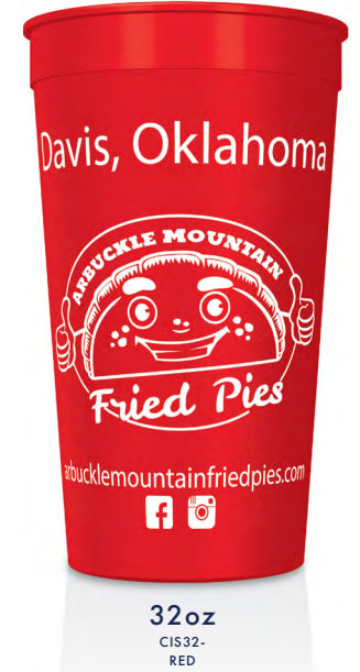
32oz CIS32- RED