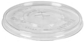
12-24oz (98) Clear Flat Slotted Lid LEF098-CX