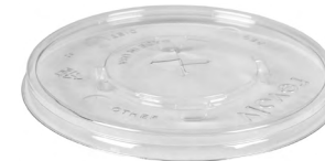
32oz (102) Clear Flat Slotted Lid CL325

Stock colors shown. Custom colors available for orders exceeding 25,000.