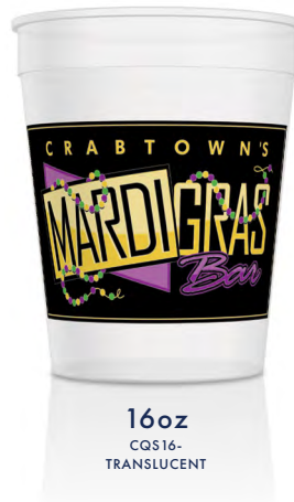
16oz CQS16- TRANSLUCENT