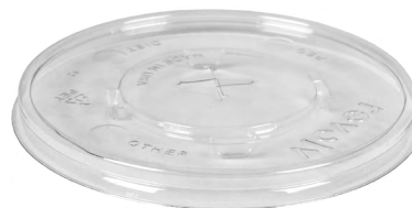
64oz (115) Clear Flat Slotted Lid LEF115-CX