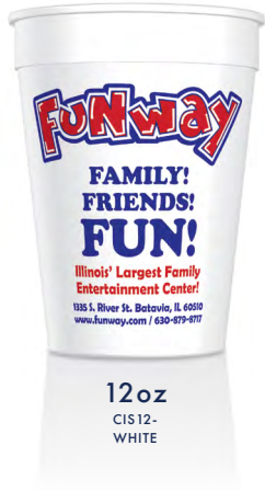
12oz CIS12- WHITE