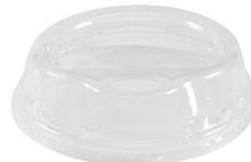
12-24oz (98) Clear Sip Lid LEF098-CS