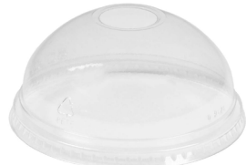
12-24oz (98) Clear Dome Lid ADL626