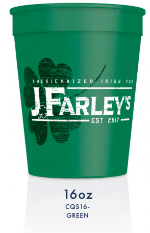
16oz CQS16- GREEN