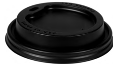
12-24oz (93) Black Gourmet Sip Lid LSG093-KS