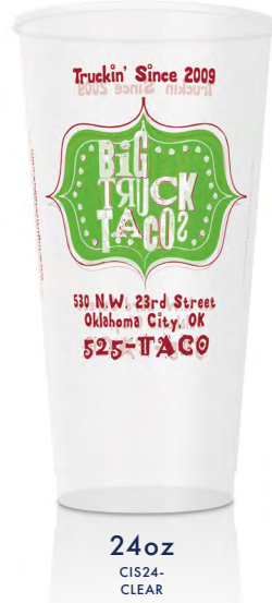
24oz CIS24- CLEAR