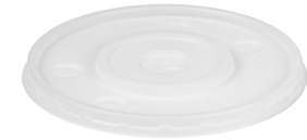
32-44oz (115) Translucent Flat Slotted Lid LSF115-TX