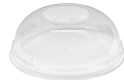
32-52oz (117) Clear Dome Lid LED117-CH

Floor stocking available when annual usage exceeds 100,000 cups per size.