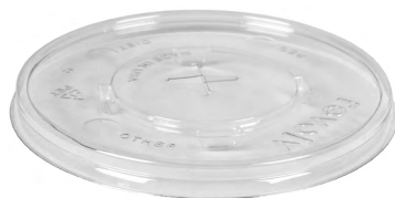
32oz (102) Clear Flat Slotted Lid CL32S