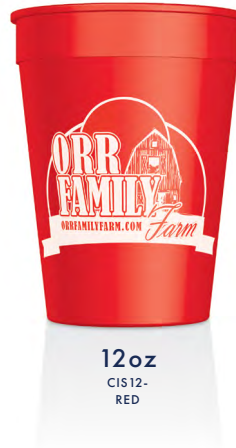
12oz CIS12- RED