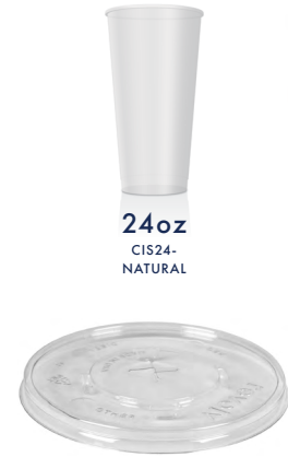
24oz (90) Clear Flat Slotted Lid CL245