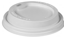
12-24oz (93) White Gourmet Sip Lid LSG093-WS