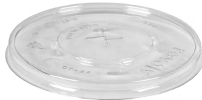
16oz (92) Clear Flat Slotted Lid A662P